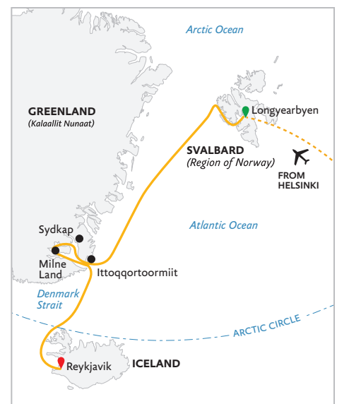
THREE ARCTIC ISLANDS: Iceland, Greenland, Spitsbergen Onboard the Ocean Explorer ——— Flight from Helsinki - - - - -

Exploring Spitsbergen, the largest island of the Norwegian Svalbard archipelago, rewards you with austere beauty and opportunities to spot its abundant wildlife. Here, you'll visit spectacular glacier fronts and tundra in full bloom, with walrus, polar bears and Svalbard reindeer amongst your possible wildlife sightings. Birders will be thrilled to see Arctic terns, skuas, Brünnich's guillemots, black-legged kittiwakes and ivory gulls. If conditions allow, you could sail within 10 degrees of the North Pole!