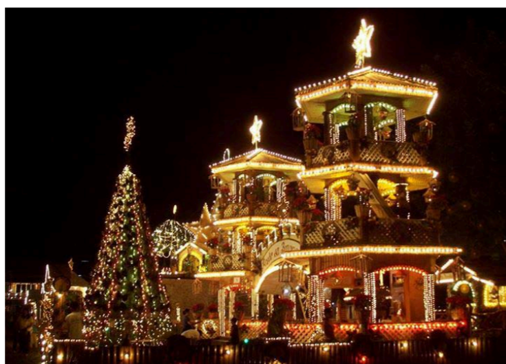
Bottom right: A Philippine 'parol' which is a pole with a lighted star at the top